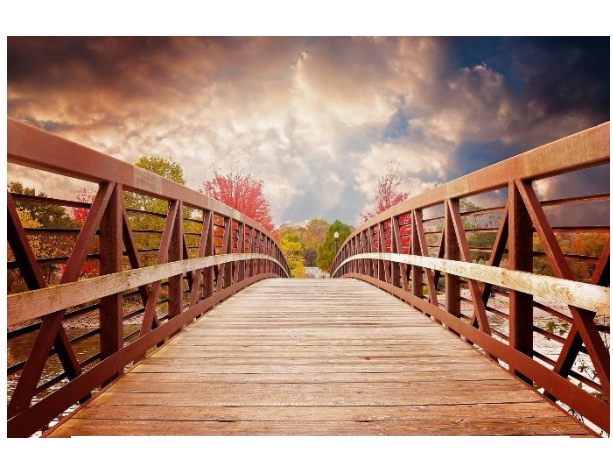
Let your light shine! Matthew 5:16

N1101 810th St Mondovi WI 54755 715-875-4571 Pastor Bethany's Contact Info: C: 402-520-5504