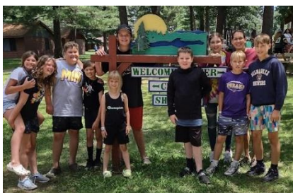
Luther Park Bible Camp

An Altar in the World: A Geography of Faith is like an invitation from the author, Barbara Brown Taylor. She coaxes the reader out of the pews and into the world as she shares her own discoveries of God in all facets of life. She ventured out of her routine and into the world where she discovered the sacred in what at first seemed ordinary. She speaks a truth that will pique your interest and make you want to go looking for God in new places too.