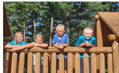
Our Partnership with Holy Play